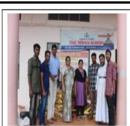
Transporting and delivering Flood relief funds and materials at the District collection centre, Pathanamthitta. Date:14/8/2019

During August 2019 Kerala Floods, staff and students generously contributed to the flood relief fund raising and material collection project initiated by the institution. This was later delivered at the district collection centre at Pathanamthitta.