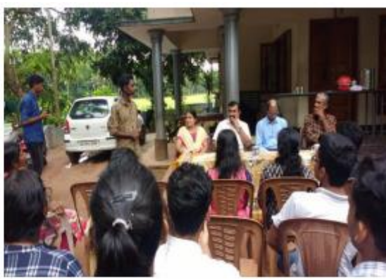
Training undertaken for LED bulb making.Date 07/09/2019

The NSS volunteers along with the Programme Officers visited the Rural Science & Technology centre, Thuruthikara for training the volunteers in LED Bulb making. The students also undertook a training session and class for developing an awareness safe bio waste disposal methods.