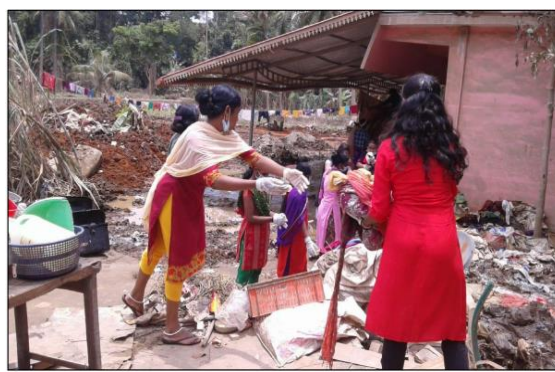
Involvement of NSS volunteers in flood related cleaning drive. Date 18/8/2018 - 23/08/2018

Ranni was one of the most affected areas during the 2018 floods and NSS volunteers of the college actively participated in helping the people who were severely affected by the flood. They provided essential food items to the flood victims and helped them to clean and sanitize their houses. The volunteers divided themselves into six groups and rendered their service for six days.