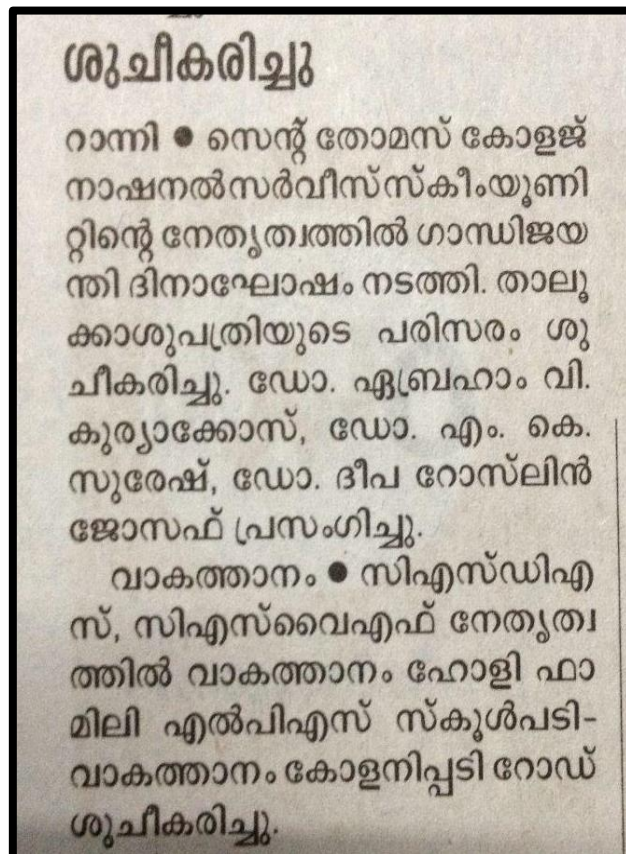
Thaluk Hospital Cleaning Drive as part of week-long Gandhi Jayanthi Celebration. Date: 05/10/2017

On 5 th October 2017, NSS volunteers organised a cleaning drive at Thaluk Hospital, Ranni in connection with the week-long Gandhi Jayanthi celebration. The drive included initiatives like cleaning hospital premises and the sides of the approach road to the hospital