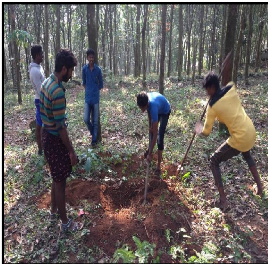
Involvement of NSS Volunteers in Rainwater Harvesting Drive at Ranni-Perunadu.