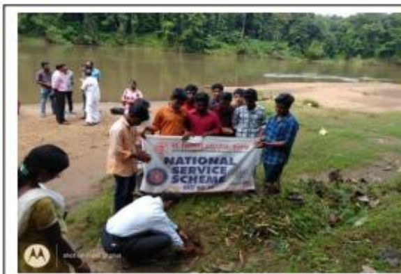
Planting bamboo along Pampa river bank .Date:03/08/2019

In association with the Pazhavangadi Grama Panchayat, the NSS volunteers planted bamboo along the Pampa riverside for protecting the river bank from erosion.