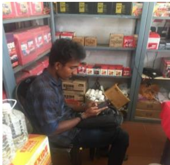
Involvement of NSS volunteers in conducting a survey of the industrial damage after flood. Date29/10/2018-05/11/2018

From 29 th October to 5 th November 2018, NSS volunteers assisted the officials of the Department of Industries and Commerce, District Industries Centre, Kozhencherry in conducting post-flood SME Survey to assess the industrial damage of the flood affected enterprises in ward No. 13 of the Pazhavangadi Panchayat and also to upload the damage data on the specially designed mobile app.