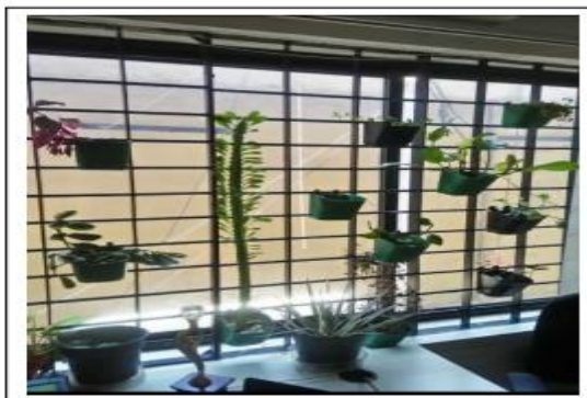
Planting tree saplings in house premises during Covid 19 Pandemic period. Date 5/6/2020

On 5 th June 2020, as part of the observance of World Environment Day, NSS volunteers were encouraged to plant tree saplings in their house premises. Cleaning of the courtyard was conducted by most of the volunteers. Total 100 volunteers were involved in this mission.