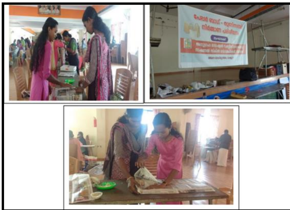
NSS Volunteers undergoing training in making eco-friendly bags. Date: 13/01/2020-15/01/2020

The NSS volunteers along with the Programme Officers visited National Skill Development Board, Pathanamthitta to undertake a training for making eco-friendly cloth and paper bags.