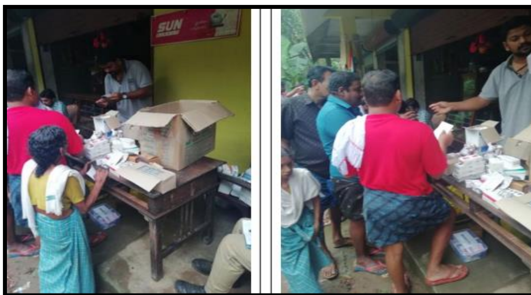
Assistance in the medical camp at Mandirampadi and distribution of medicines at Adichippuzha Tribal Colony. Date 18/08/2018

NSS volunteers assisted the medical team of Thaluk Hospital, Ranni, in conducting the medical camp and distributing medicines to the flood victims at Mandirampadi and Adichippuzha Tribal Colony.