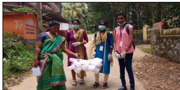
NSS Volunteers involved in collecting water samples from flood-affected wells for bacterial analysis. Date 06/09/2018

NSS volunteers assisted the officials of Haritha Keralam Mission and Kerala State Pollution Control Board to collect water samples from 600 flood-affected wells in Ranni-Angadi Grama Panchayat for bacterial analysis and remedial action.