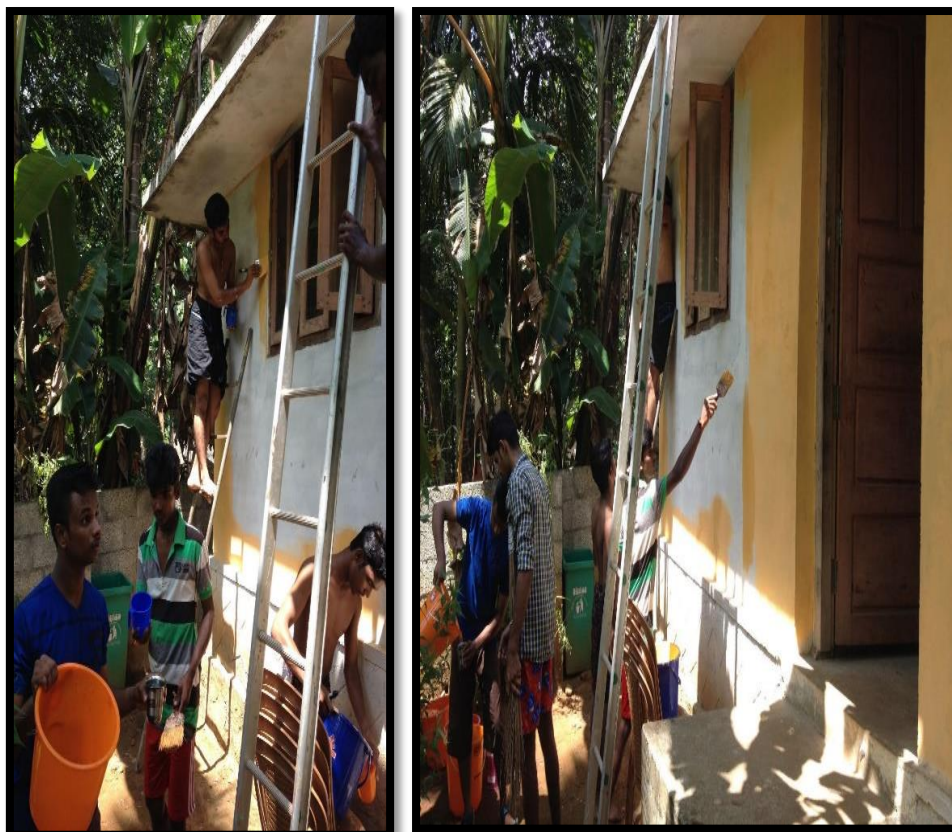
Anganvady Renovation Drive at Mothiravayal, 52 colony. Date: 02/10/2017

NSS volunteers initiated a small scale renovation drive at the Anganvady situated in Mothiravayal, 52 colony. The drive included activities like painting, minor refurbishing and maintenance tasks, cleaning the premises etc.