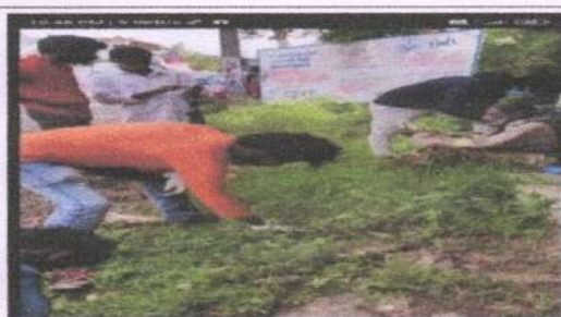
Cleaning Drive at Perunthenaruvi Tourist Centre in May 2022

Students volunteered to clean the tourist spots under the jurisdiction of Perunthenaruvi tourist Centre in Vechoochira Grama Panchayat in May 2022